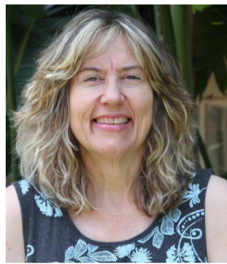
By Beryl Carvalho OCULARIST

When getting an eye prosthesis for the first time, it can be a very nerve-wracking experience for patients, as they have usually been through an evisceration (removing the contents of the eye) or enucleation (removing the complete eye). The first session often requires time to set the patient's mind at ease with the process ahead.